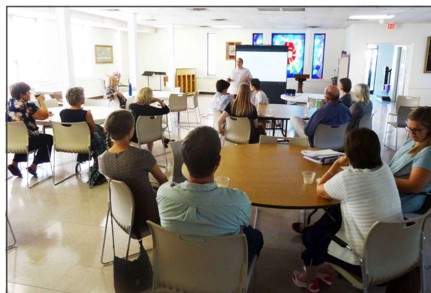
Youth Mission Presentation