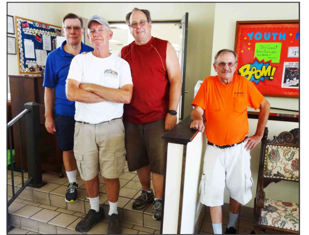
Many thanks to our St. Paul's Men in Mission for stripping and waxing the floors in Kever Hall!