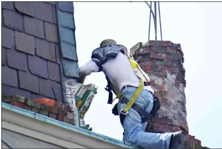
A year after Hurricane Florence brought them down, our steeple finials have been replaced!