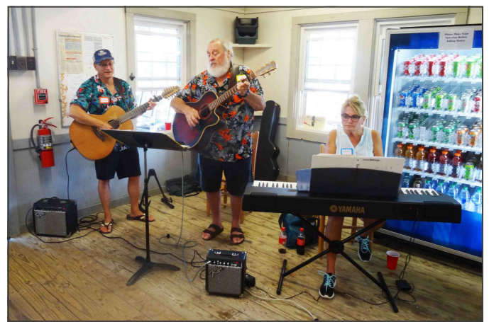
Shrimp Boil at the Hanover Seaside Club