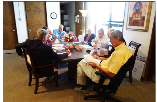
Finance Team Meeting in the Church Office